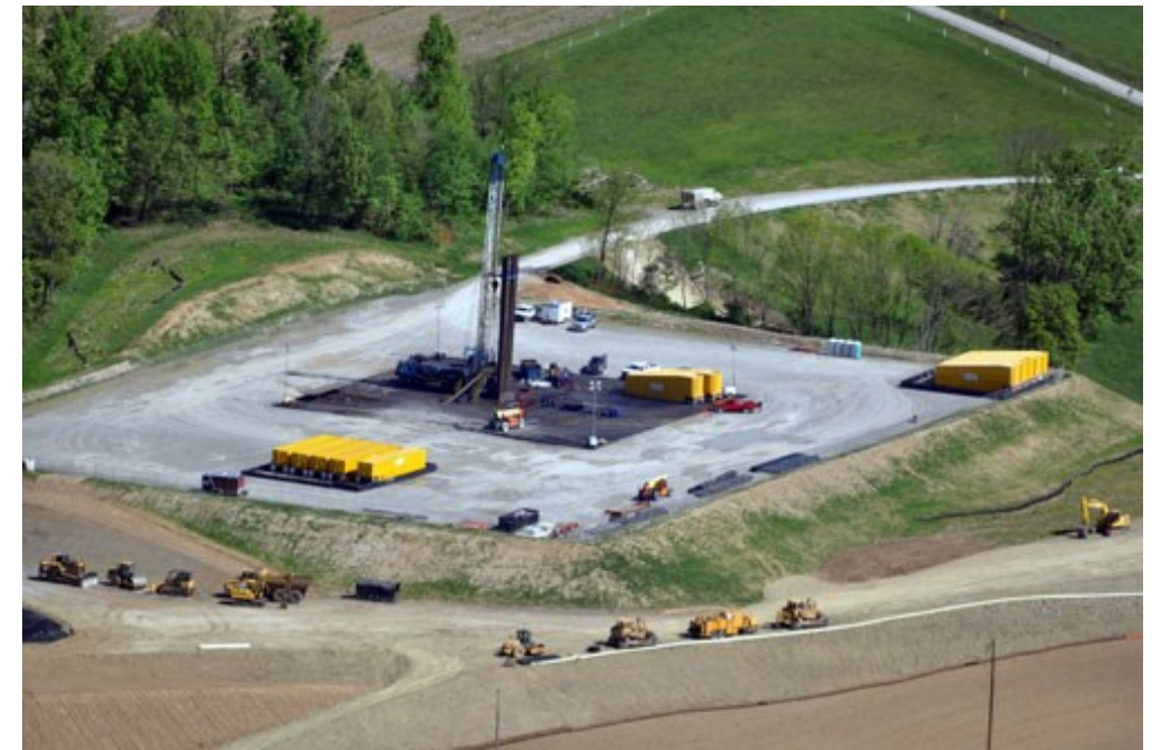
Drilling Pad in Jefferson County

Ohio Mid-Eastern Governments Association